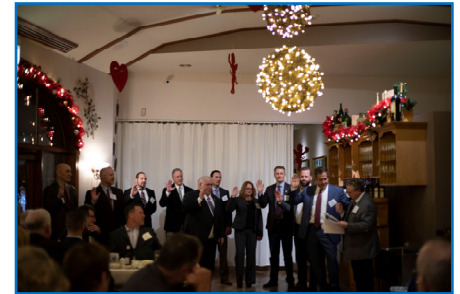
2022 PCA Board of Directors taking their Oath of Office